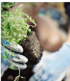
Remove the plant and loosen the roots gently.

Carefully remove my container by holding the top of my rootball and gently sliding me out. If needed, loosen my roots slightly with some gentle squeezing. Be careful not to disturb my roots too much or I'll go into shock.