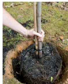
Make sure to plant level with the existing soil. The biggest planting problem we see is planting too deep.

Dig my hole twice as wide and the same depth as the container that I came in. Set me in the hole and be sure that the top of my rootball is level with the surrounding soil.