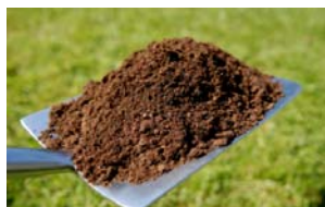
For acid-loving plants, use Kerby's Pulverized Pine Soil, peat or cow manure.

I love a good rich soil, so prepare a planting mix of 1 part Kerby's Planting Soil and 1 part existing soil. If I'm an acid-loving plant, add one part Kerby's Pulverized Pine Soil, peat or cow manure.