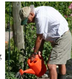
Watering new plants is critical, even a single day missed can weaken them.

As a new plant, I'm going to need plenty of water to get growing. Follow this schedule to help me develop a strong root system: