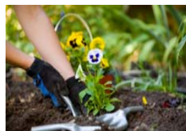
Build a dirt ring around larger plants and trees to hold water over the rootball.

Fill the hole with the planting mix from Step 2, packing the soil lightly to remove any air pockets. Soak thoroughly to make me feel at home in your garden.